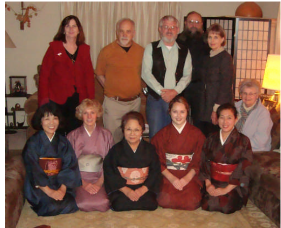
Ward Sensei with students and guests